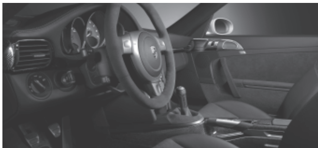
Carbon interior package

* Please consult with your Porsche Centre for availability.