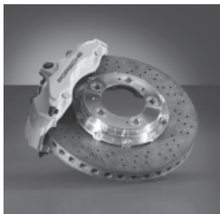
Porsche Ceramic Composite Brake (PCCB)

* Please consult with your Porsche Centre for availability.