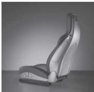
Adaptive sports seat